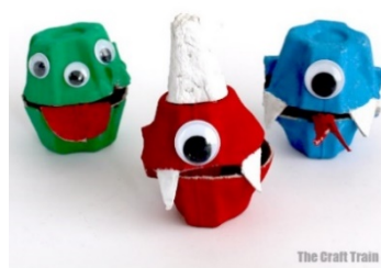
The Craft Train